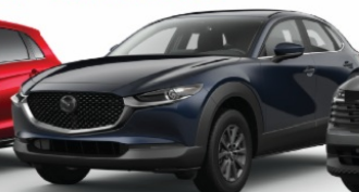
2025 Mazda CX-30 2.5 S