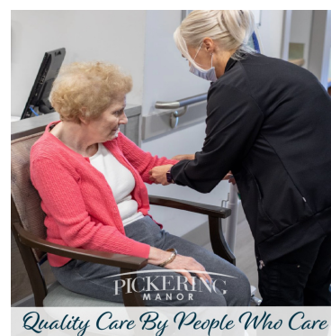
Quality Care By People Who Care

Pickering Manor is a Life Plan Community that has proudly served the area for over 60 years. As a 5-star non-profit community owned by the Community Welfare Council of Newtown, we are dedicated to providing compassionate care and exceptional service, offering the full continuum of care!