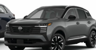
2025 Nissan Kicks SV