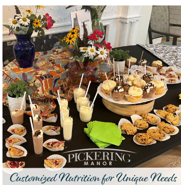
Customized Nutrition for Unique Needs