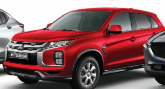
2025 Mitsubishi Outlander Sport S