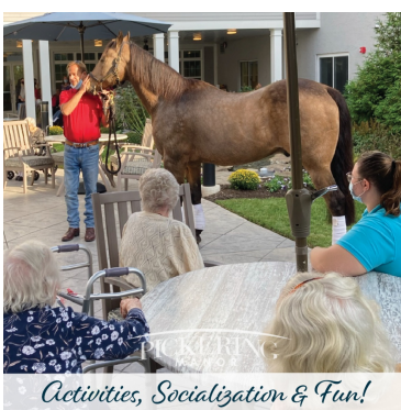
Activities, Socialization & Fun!