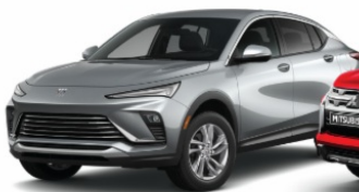
2025 Buick Envista Preferred