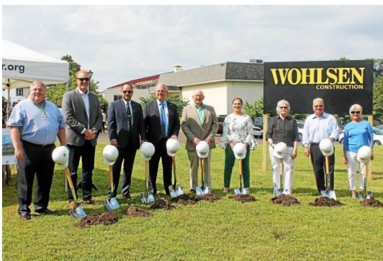
Yates Pavilion Groundbreaking (2018)

Over 5 years ago, in July of 2018, Pickering Manor broke ground on its largest expansion to date; the 26,000 square foot Sidney T. Yates Pavilion complete with a beautiful rehab gym, 15 Short-Term Rehab rooms, and 15 Personal Care rooms. Plus, it was three years ago this month, on September 29, 2020, we joyfully moved our first residents into the 'Yates Pavilion'.