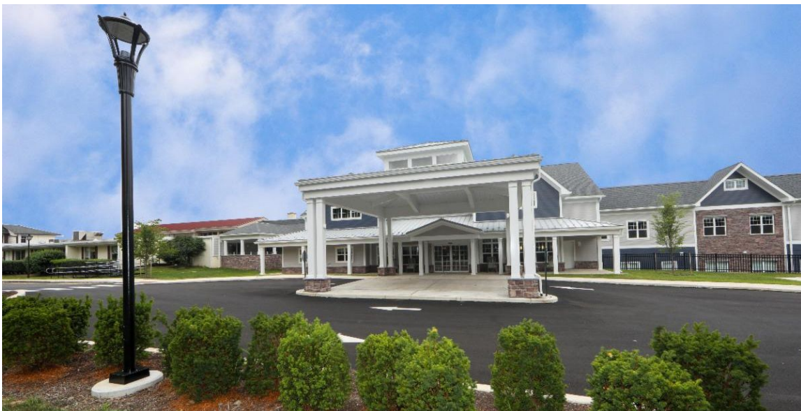
Pickering Manor Yates Pavilion Main Entrance

HAPPY BIRTHDAY YATES PAVILION & MEMORY CARE!