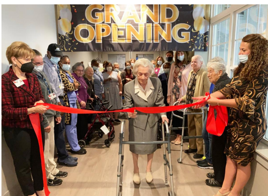
Memory Care Grand Opening (2022)

Although our 'space' has grown, we continue our mission of providing a small, friendly family-oriented space within our Pickering Manor community.