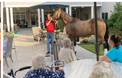
Activities, Socialization & Fun!