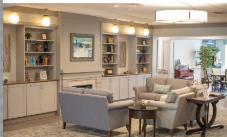
A Beautiful Place to Call Home

Nestled in the heart of historic Newtown!