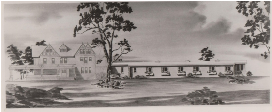
Pickering Manor Rendering (1963)

Pickering Manor has grown significantly in the past 60 years from a small nursing home of 47 residents to a newly-expanded and renovated Life Plan Community offering the full continuum of care.