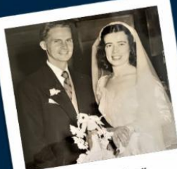
"A Slice of Bliss"

I drove a Buick, worked at a bank, played basketball and liked to ice skate.