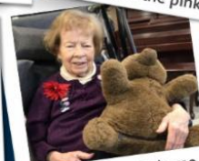
"This bear reminds me of a dog we called...Trixie"