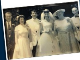
"Love At First Sight"