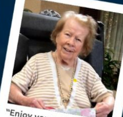
"Enjoy yourself while your still in the pink!"