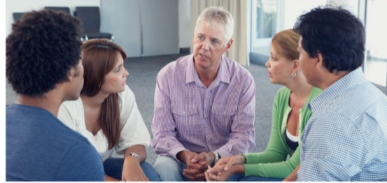
ALZHEIMER's CAREGIVER SUPPORT GROUP