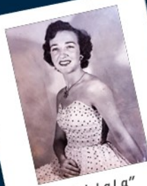
"Ooh La La"